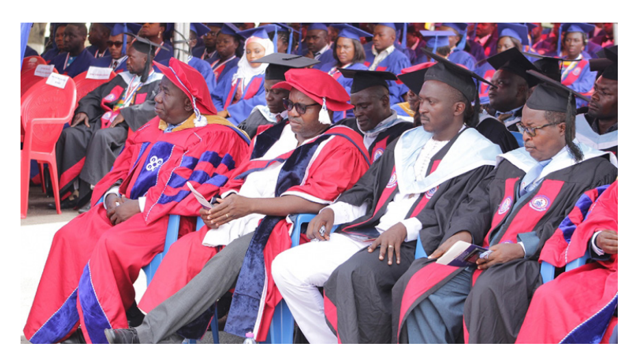
A cross-section of convocation members and graduands at the Kumasi Campus

This was followed by a total of 396 students who graduated from the Faculties of Technical Education, Education and Communication Sciences, and School of Graduate Studies also with various certificates and degrees from Kumasi Campus on Wednesday, 24th April, 2019.