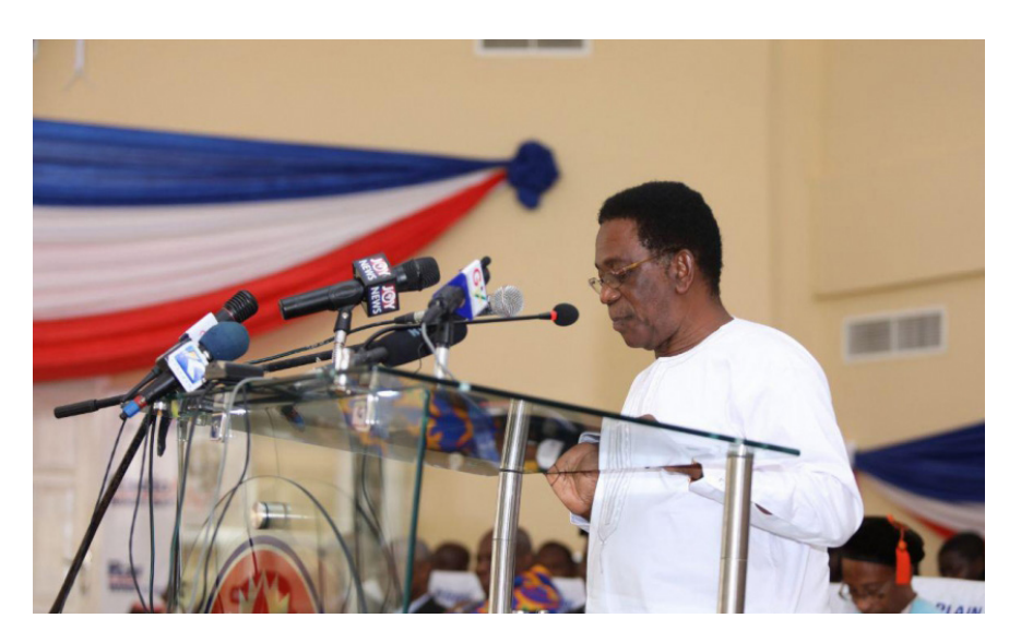
Minister of State in Charge of Tertiary Education, Prof. Kwesi Yankah addressing attendees

The Minister of State in Charge of Tertiary Education, Prof. Kwesi Yankah challenged graduands to strive to pursue honesty, sincerity, hard work, commitment, determination, dedication and ideals that would make them successful in life and make UEW and Ghana proud as well.