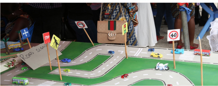
Samples of the TLM's