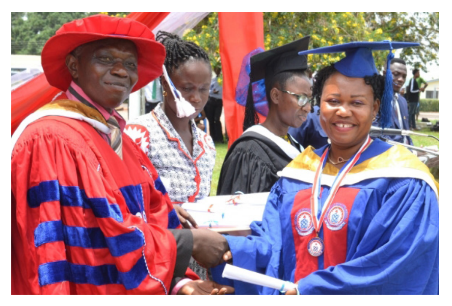
A female student at Asante Mampong Campus all smiles as she receives her certificate

This was followed by a total of 396 students who graduated from the Faculties of Technical Education, Education and Communication Sciences, and School of Graduate Studies also with various certificates and degrees from Kumasi Campus on Wednesday, 24th April, 2019.