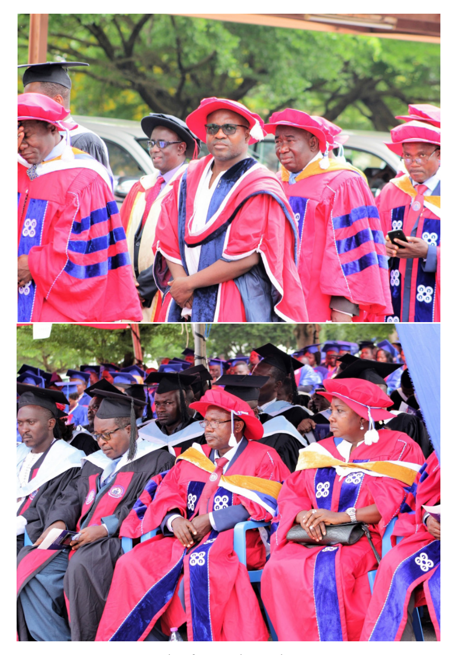
A section of convocation members