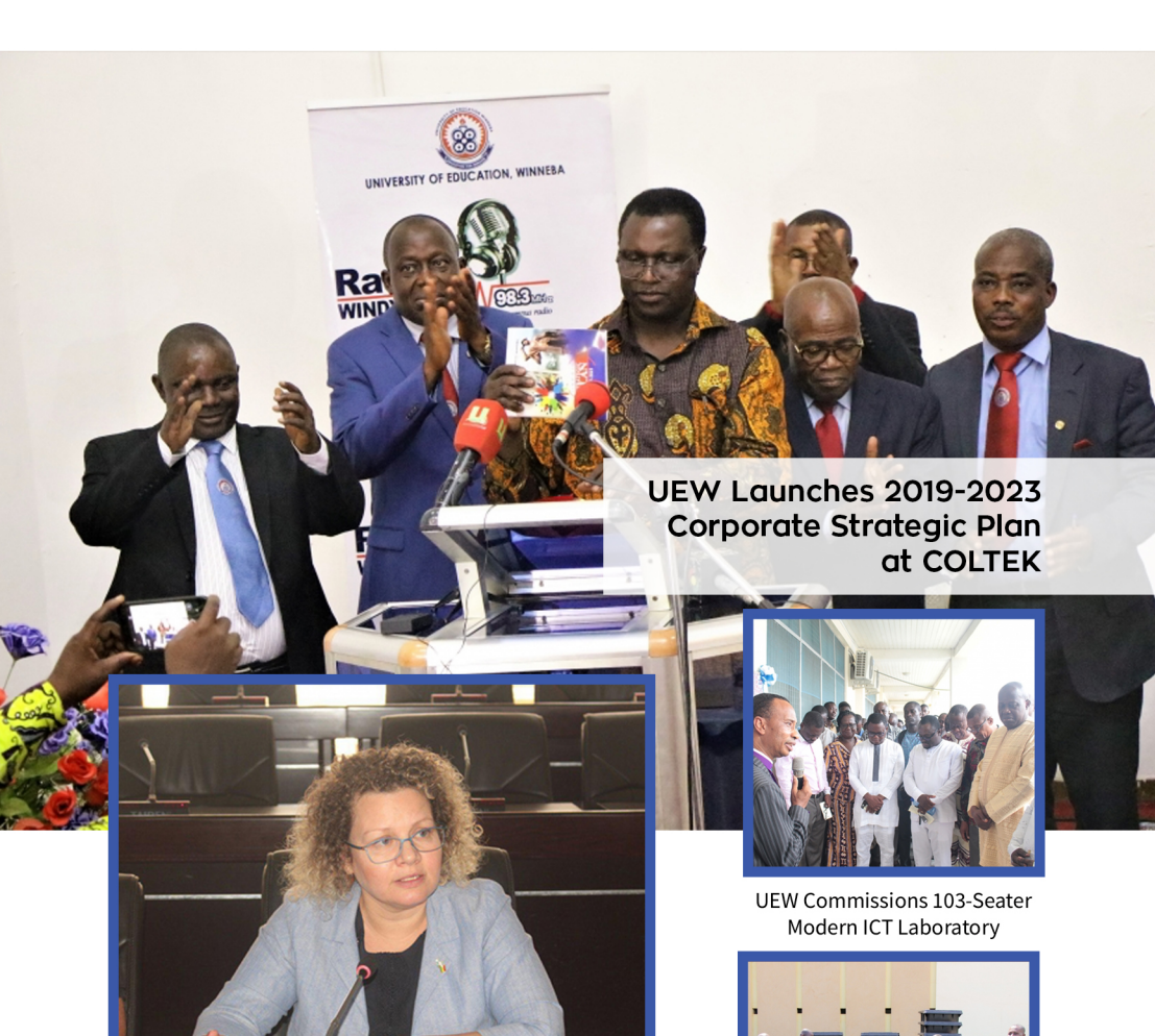
UEW Hosts Israeli Ambassador to Ghana, Liberia and Sierra Leone