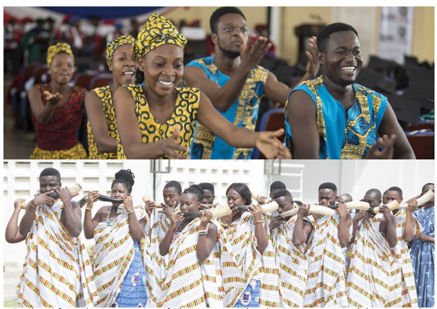
Students from the Department of Theatre Arts, Winneba Campus entertaining guests in a cultural display