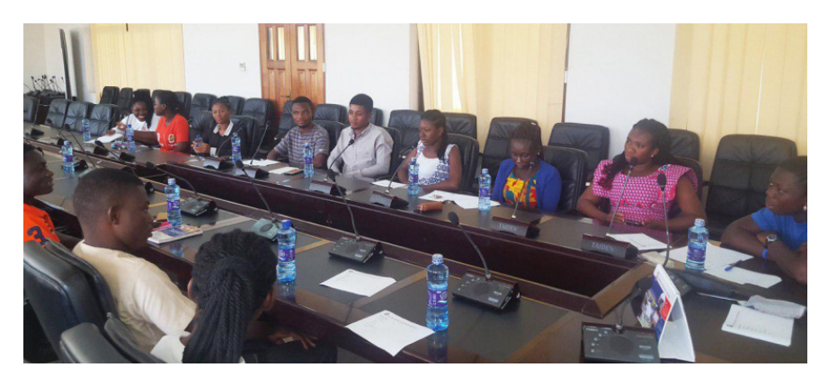
Scholarship Beneficiaries and staff from the Gender Directorate during the interaction

29 beneficiaries of the Pent Scholarship and Vodafone Ghana Foundation Scholarship from the University of Education, Winneba (UEW) have been spurred on to make worthy profits of the scholarships and to focus on their books to make themselves and the benefactors proud.