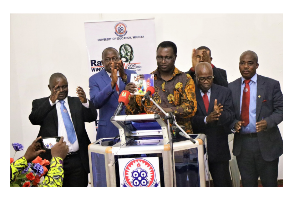
Principal Officers of UEW supporting the Deputy Minister to unveil the CSP

The University of Education, Winneba (UEW) has launched its fourth 5-year (2019-2023) Corporate Strategic Plan (CSP) that would facilitate the successful execution of its core mandate as the foremost teacher training university in Ghana.