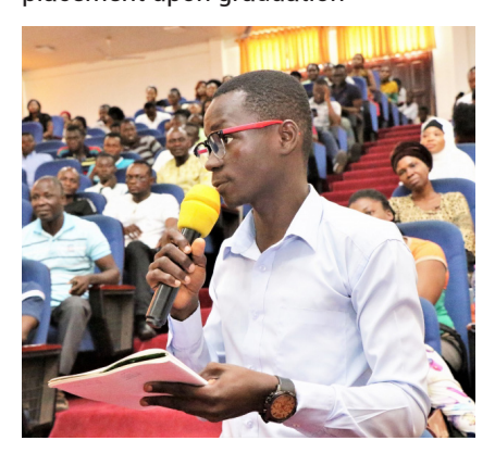
A student asking a question at the orientation while his colleagues look on

The College's Industrial Liaison Office (ILO), which organised the orientation, underscored the shifting paradigm in tertiary education training from theories to practical experience gathering to brighten students' chances of job placement upon graduation