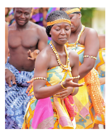
Some cultural dancers during a colorful display at the ceremony