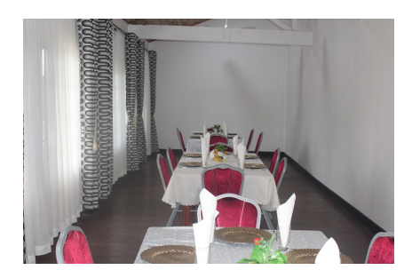
A part of the VVIP section of the Food Production Unit

The Food Production Unit Restaurant has a seating capacity of 150, well-furnished and with a relaxing atmosphere at the ground floor. It also has a VVIP section and a storage facility on the first floor of the restaurant. They serve a variety of local and continental dishes like pizzas, sea foods, salads, beef food, sandwiches, potato chips, pastries and drinks.