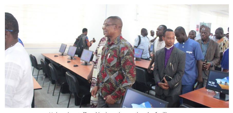
University staff and invitees inspecting the facility

This adds up to the existing ICT centre at the South Campus of the University and also serves as a source of great relief to UEW students who otherwise would have travelled on a daily basis to the University's South Campus for ICT lessons. The GH 500,000 ICT centre will also enhance teaching and learning as well as intensify research and academic work on campus.