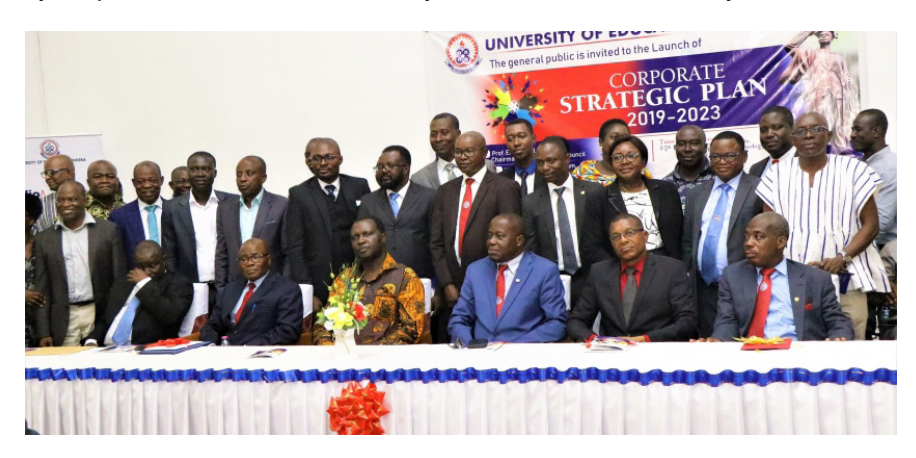
Some staff of COLTEK in a group photograph with UEW Council Members and the High Table

In his view, developing and committing to implementing a CSP was so important since it safeguards institutions against reactive tendencies and their attendant costs. He therefore appealed to all relevant stakeholders to embrace and be strictly guided by the provisions of the CSP in all they did in and for the University.