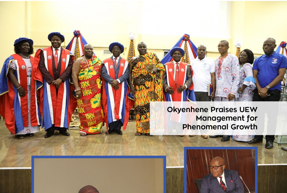
Okyenhene Praises UEW Management for Phenomenal Growth