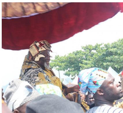
Overlord of Dagbon, Yaa Na Abubakari Mahama II