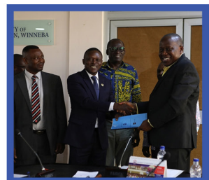
UEW Collaborates with Association of Chartered Certified Accountants