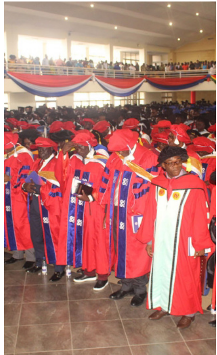
Convocation members in attendance