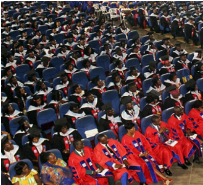
Graduands and Convocation members at the 24th Congregation ceremony

"We earnestly appeal to Government for financial clearance to recruit more staff, especially academic staff to meet our expanded population, and in anticipation of the large number of Senior High School (SHS) students who will be seeking admission into the University following the government's flagship Free SHS initiative," he emphasised.