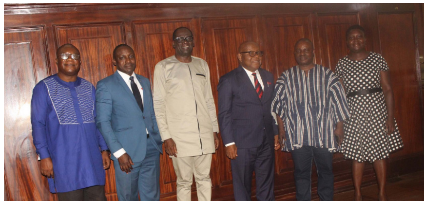
The Speaker of Parliament in a group photograph with the UEW delegation