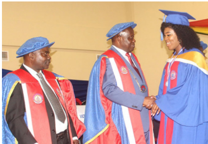
Some graduands who graduated with 1st Class Honours in a handshake with the Vice-Chancellor and University Management