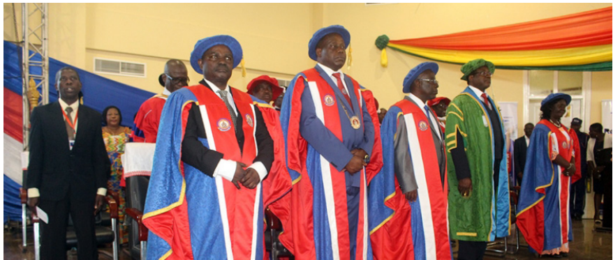
University officials and dignitaries