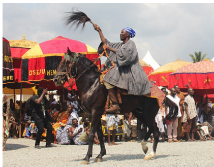
horse display by the people of Dagbon