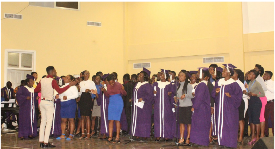
The UEW Choir in attendance