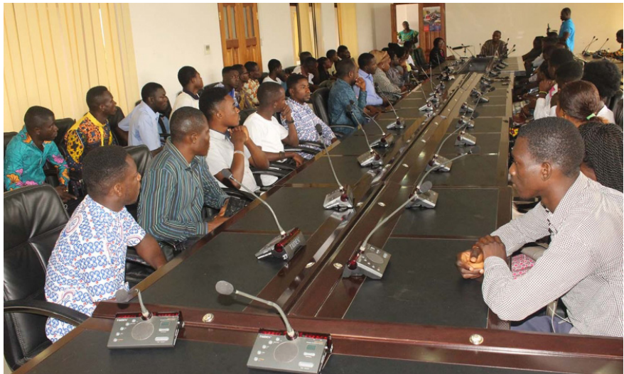
Students from the Winneba Campus who benefited from the VCSF for the 2018/2019 academic year