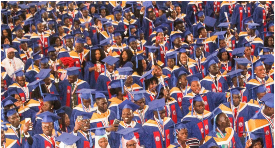
The Jophus Anamuah-Mensah Conference Centre was filled to capacity during the Winneba Campus sessions of the Congregation

The University of Education, Winneba (UEW) has graduated a total of 16,489 students at its 24th Congregation ceremonies held from Thursday, 17th to Saturday, 26th October, 2019 at the Winneba, Asante-Mampong and Kumasi Campuses of the University.