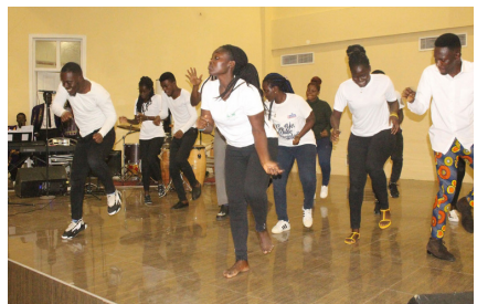
Some students and staff who were present & Students from the School of Creative Arts in a performance during the program