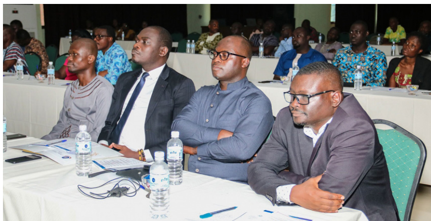
Participants listening attentively during the presentations