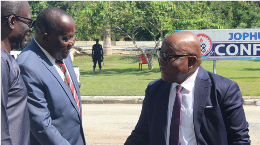
Speaker of Parliament, Rt. Hon. Prof. Michael Oquaye (right) exchanging pleasantries with the Vice-Chancellor (middle) and Pro-Vice-Chancellor of UEW

He advocated for allocation of seats to women who would like to contest for elections and urged political parties to reserve a quota for women to encourage their participation in politics and governance.