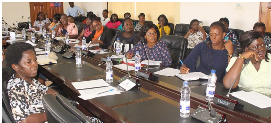
A section of female senior members who present at the workshop