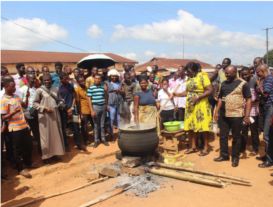
Participants during a demonstration session