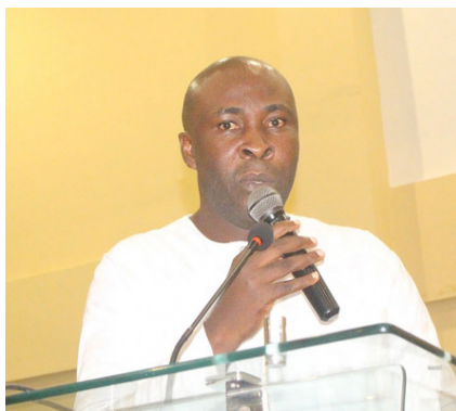
The President-elect speaking at the gathering