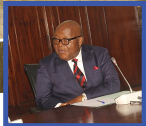
UEW to Offer Speaker of Parliament Honorary Doctorate Degree