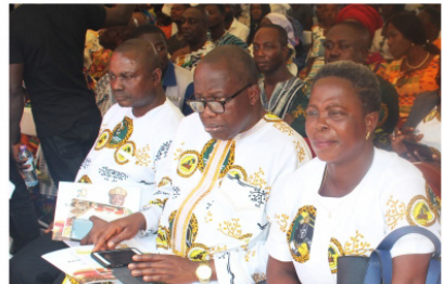
Dignitaries in attendance