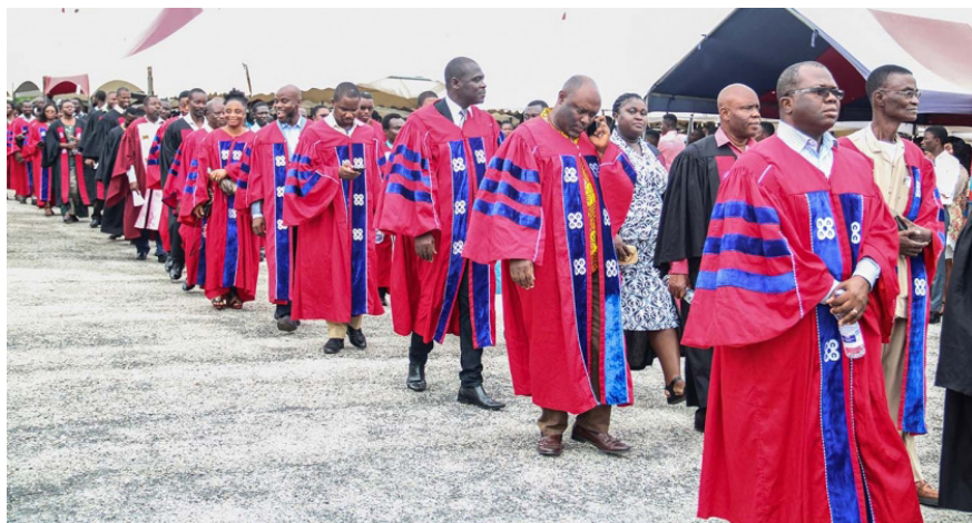
Convocation members in procession