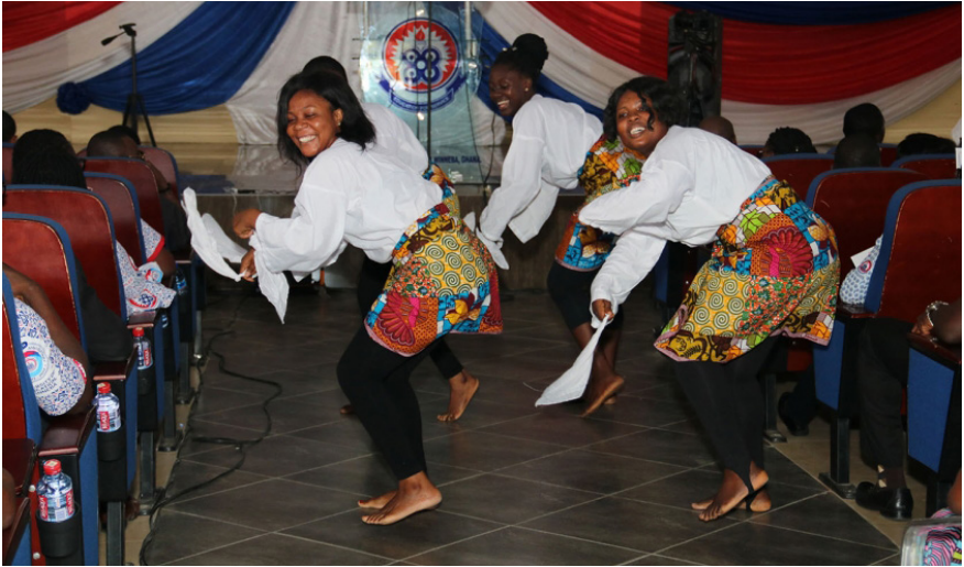
Students from the School of Creative Arts in a spectacular performance at the public lecture