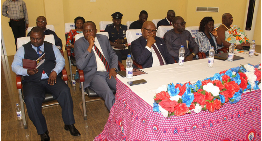
Dignitaries who graced the occasion

"The traditional notion of 'the place of a woman is the kitchen' or 'women should take a backstage' has come a long way to influence our perspectives as a people and this line of thinking should be corrected at all levels," he said.