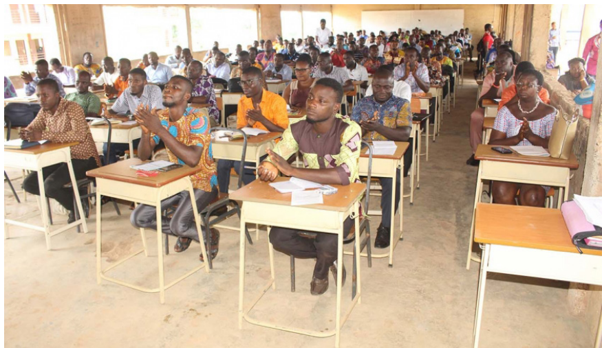
Teachers from the district in attendance