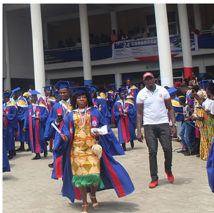
Some of the graduands who could not hide their joy during the just ended 24th Congregation

The Winneba Campus sessions ended on Saturday, 19th October, with a total of 2,601 students from the School of Graduate Studies, School of Creative Arts and the IDeL Study Centres of Cape Coast, Denu, Ho, Koforidua, Odumasi Krobo, Sekondi, Tarkwa, Sogakope, Tema, Winneba and Kasoa graduating.