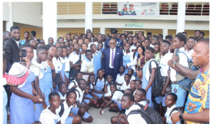
Some First and Second Cycle students in the Municipality in a pose with Rt. Hon. Prof. Michael Oquaye