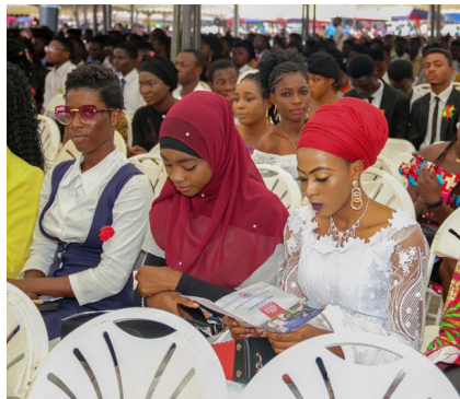
Some of the students admitted for the 2019/2020 academic year

The ceremony, held at the Jophus Anamuah-Mensah Conference Centre Grounds, provided the opportunity for the freshmen to pledge their allegiance to the authority of the University through the administration of the Matriculation Oath.