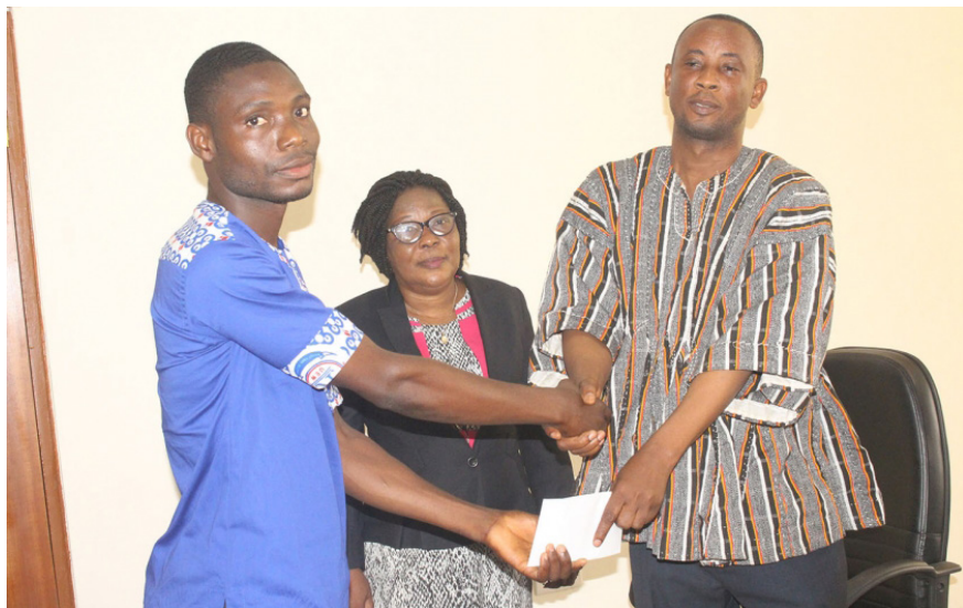
Some of the beneficiaries receiving their award letters

A total of 279 students at the four Campuses of the University of Education, Winneba (UEW) have benefited from the Vice-Chancellor's Scholarship Fund (VCSF) for brilliant but needy students for the 2018/2019 academic year.