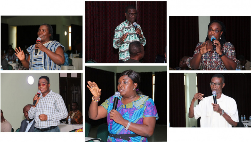
Some contributors who made valuable contributions during the programme