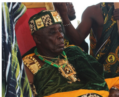
Paramount Chief of Akyem Abuakwa, Osagyefo Amoatia Ofori Panin II

The ceremony, held on Saturday, 14th December, 2019, displayed rich Ghanaian culture such as dances, apparels, drums, appellations and poems.