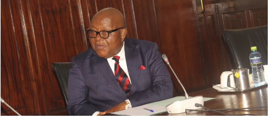
Speaker of Parliament, Rt. Hon. Prof. Oquaye