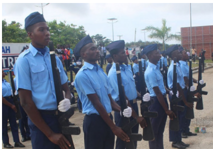
UEW Airforce Cadet Corps during a parade