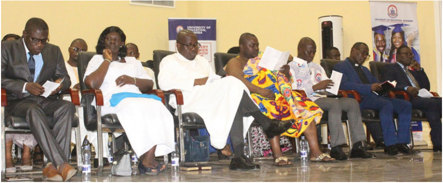
Some University Officials with the Vice-Chancellor (third from left) during the Service