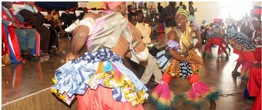
Students from the School of Creative Arts entertaining graduands and invitees with a colorful performance