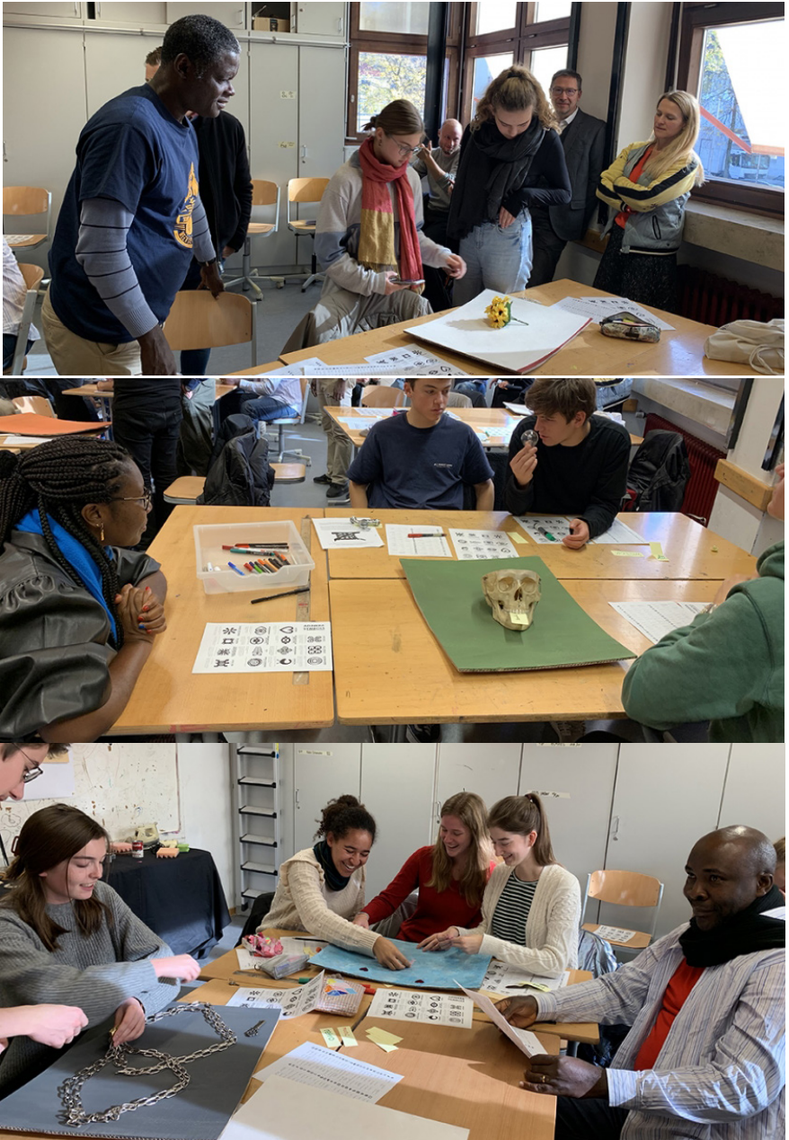
Class engagement with high school students at Wilsbacher-Gymnasium in Munich