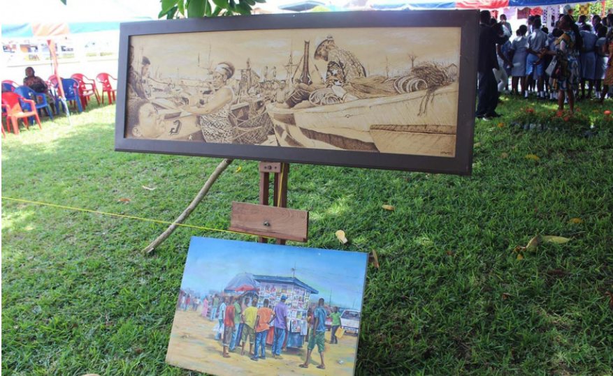
Some exhibits on display at the event